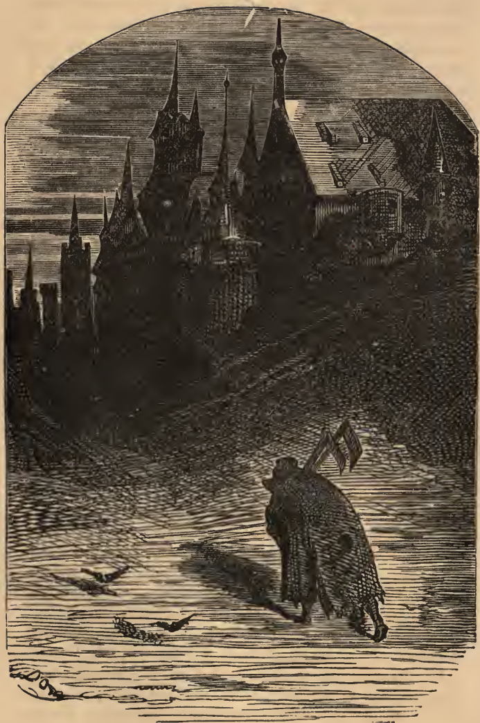
La Fallotte was a hunchback vehemently suspected of dealings in necromancy.